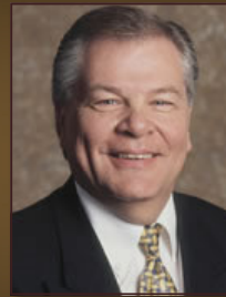
Mayor Patrick Dunlavy

political climate, why more people don't care to get more involved in the selection of the people